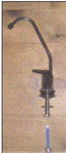
To filter (plastic connector)